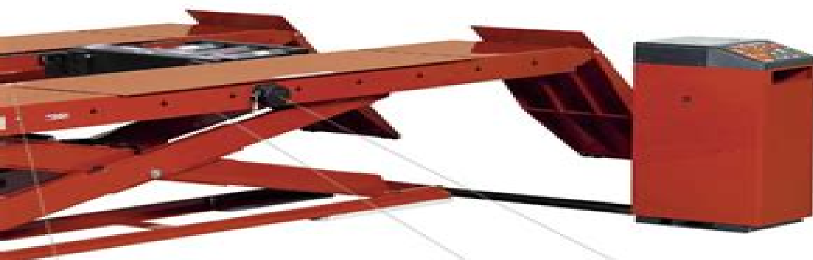
RX16T-IS shown with optional light kit