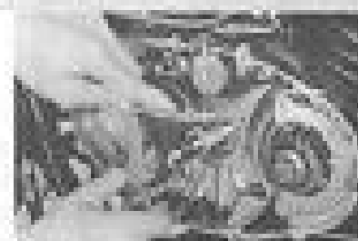
Fig. 4-17 Chain roller and pin chain guide