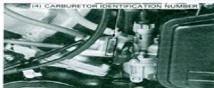
(4) CARBURETOR IDENTIFICATION NUMBER

The vehicle identification number is on the frame tube in front of the right front cover.