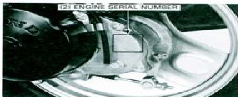
(2) ENGINE SERIAL NUMBER

The frame serial number is stamped on the left side of the frame.