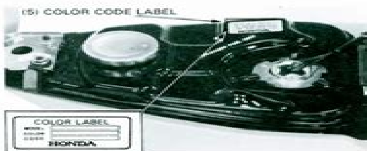
(5) COLOR CODE LABEL

The carburetor identification number is on the left side of the carburetor body.