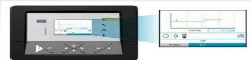
Real time trending

The superior processing capability of the Elektronikon® Mk5 enables a compressor of almost any age or type to benefit from the latest and most advanced control algorithms and functionality, resulting in improved system control and energy savings.