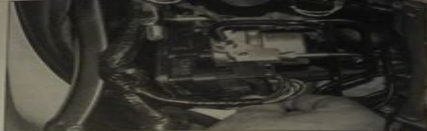
18.4b Push the catch from left to right to release ...

6 Turn the mode select switch ON, then turn the ignition (main) switch ON. The fault code will be represented as a series of flashes of the ABS indicator light.