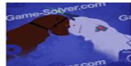
Cats & Dogs

by http://game-solver.com/ updated: 2014-03-15 Version 1.0