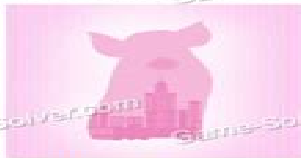
Babe Pig In The City