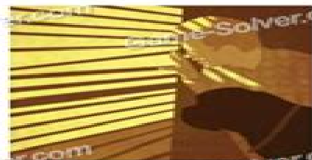
Turner & Hooch