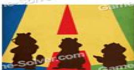
Alvin And The Chipmunks