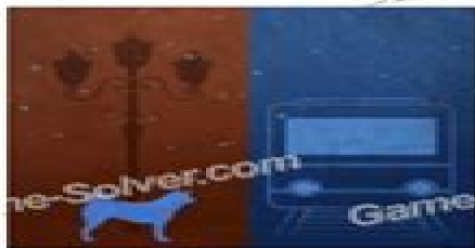
Hachi A Dogs Tale