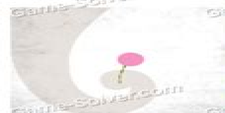
Horton Hears A Who