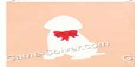
Marley & Me