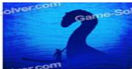
The Water Horse