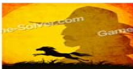
Spirit Stallion Of The Cimarron