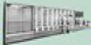
Mark I (1944)