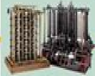
Analytical Engine (1833)