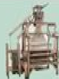
Jacquard Loom (1804)