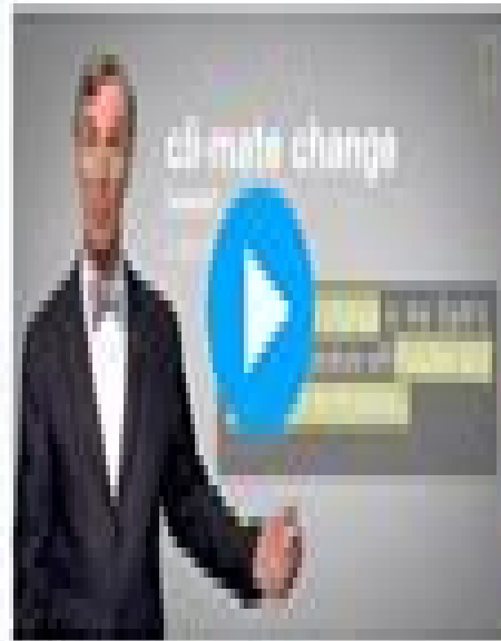
All About Climate Change