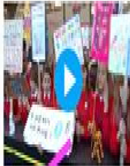
Marching for the Planet