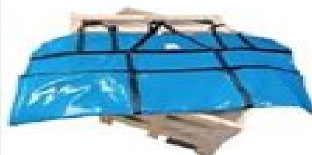
SOLAR PANEL LIFTING