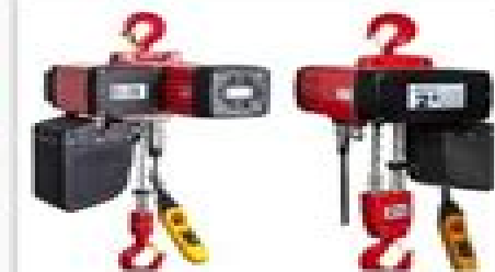
ELECTRIC CHAIN HOISTS