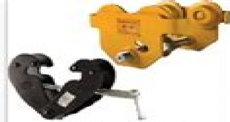
BEAM TROLLEYS & CLAMPS