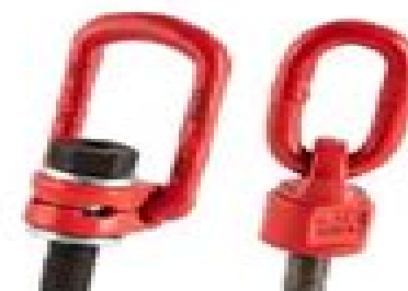
SWIVEL EYE BOLTS