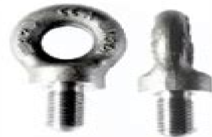
COLLARED EYE BOLT