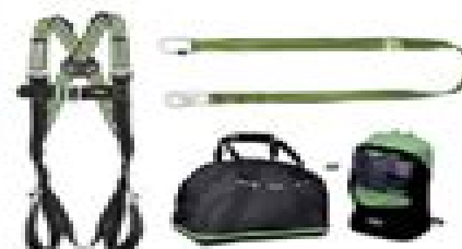
SAFETY HARNESS AND LANYARD KITS