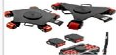
MACHINE MOVING SKATES