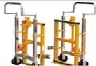
FURNITURE MOVING EQUIPMENT