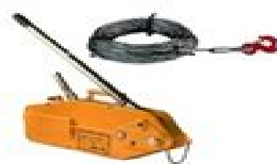
CABLE PULLING WINCH