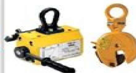
STEEL PLATE LIFTING GEAR