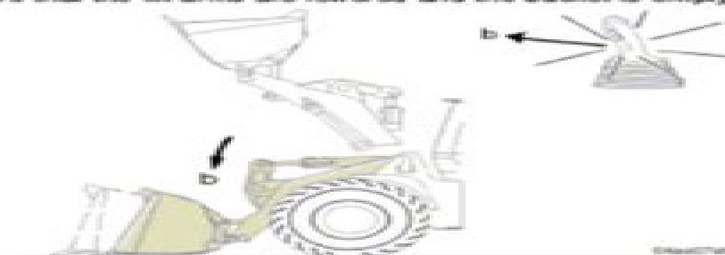
Rough digging position

Make sure that the lift arms are lowered and the bucket is empty.