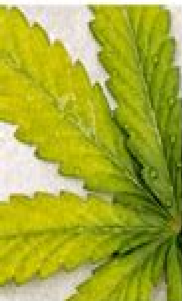
Nitrogen Deficiency or Toxicity