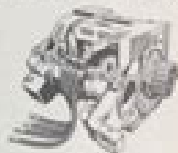
Traction Motor Fig. 1-4

Four Model D27 traction motors, Fig. 1-4, are used in each unit, mounted one on each axle. Each motor is geared to the axle, which it drives, by a motor pinion gear meshing with an axle gear. The ratio between the two gears, Fig. 1-5, is expressed as a double number such as 62/15. In this case the axle gear has 62 teeth while the pinion has 15 teeth.