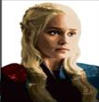
DAENERYS TARGARYEN (Ending) Emilia Clarke GOT season 8 (2018)