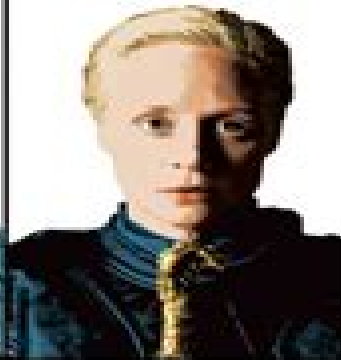
BRIENNE DE TORTH Gwendoline Christie GOT season 4 (2014)