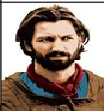
DAARIO NAHARIS Michiel Huisman GOT season 5 (2015)