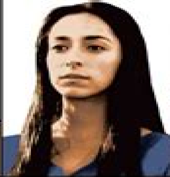
TALISA MAEGYR Ginnifer Goodwin GOT season 3 (2013)