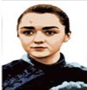
ARYA STARK (Ending) Maisie Williams GOT season 8 (2018)