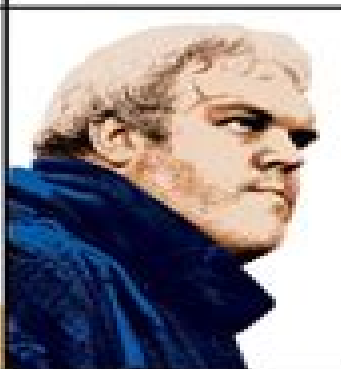
HODOR Kristian Nairn GOT season 6 (2016)