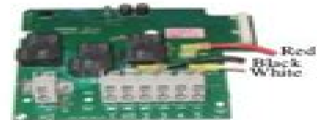
New Relay Board

Note: Make sure to slide cover bracket into slot in the metal guard.