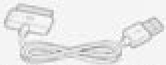
Dock Connector to USB Cable

10W USB power adapter: Use the 10W USB power adapter to provide power to iPad and charge the