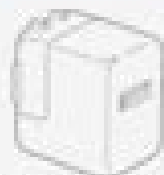
10W USB Power Adapter