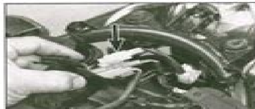
10.7 Disconnect the wiring connector (arrowed)