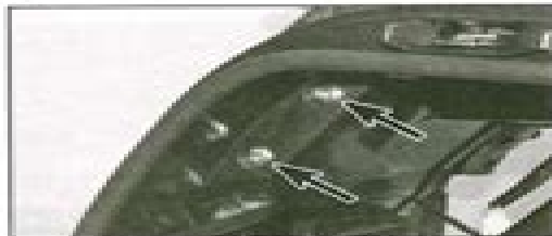
10.3b ...and the tail light screws (arrowed)...