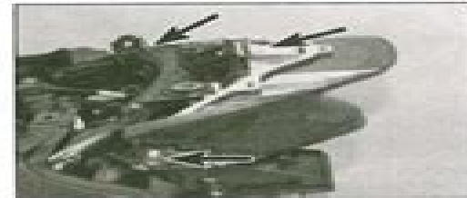
10.8 Tail light bolts (arrowed)