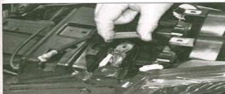
10.2a Lift the cover...