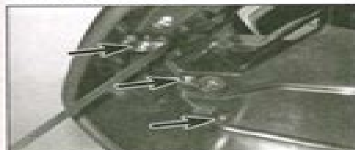
10.3a Undo the mudguard screws (arrowed)...

1 Most turn signal problems are the result of a burned out bulb or corroded socket. This is especially true when the turn signals function properly in one direction (although possibly too quickly), but fail to flash in the other direction. If this is the case, first check the bulbs, the sockets and the wiring connectors (see Sections 12 and 13). If all the turn signals fail to work, check the fuse (see Section 5), and then