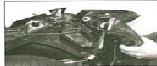
10.3c ...and remove the assembly...