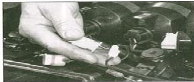
10.2b ...and disconnect the wiring

2 Lift the connector cover and disconnect the tail light and licence plate light wiring connectors (see illustrations).