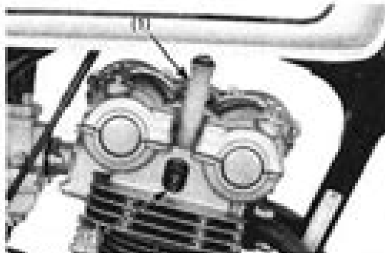
(1) SPARK PLUG CAP (2) SPARK PLUG

Check the fuel hose for cracks, deterioration or leakage.