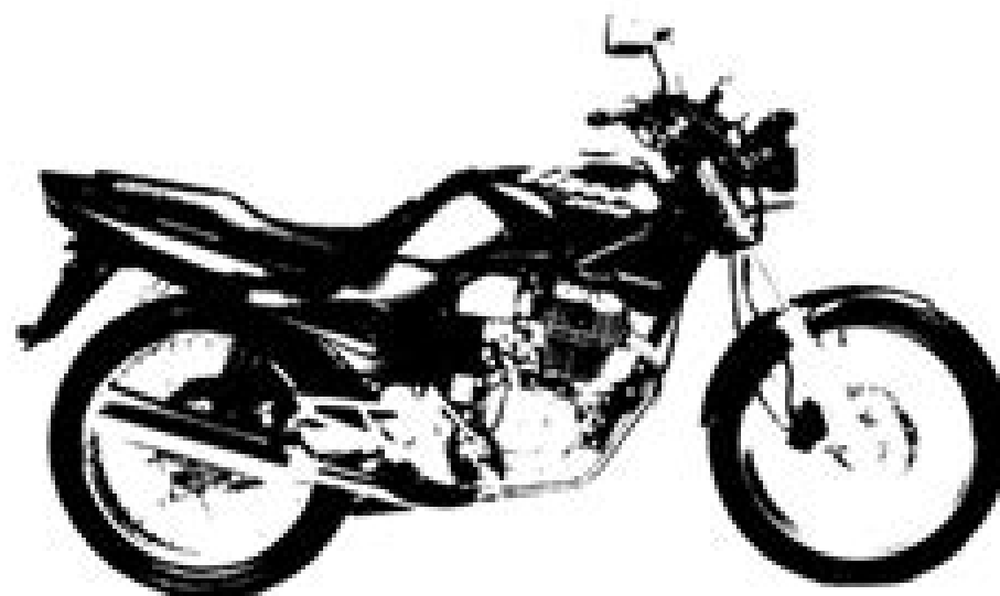
Model : GL200