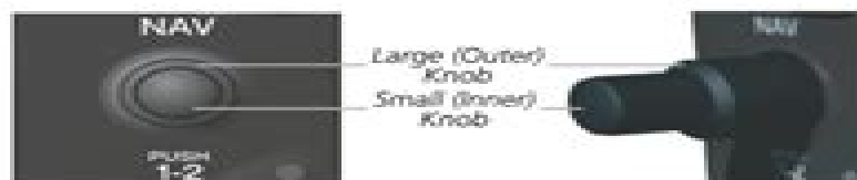
Figure 1-3 Dual Concentric Knob

The NAV , CRS/BARO , COM , FMS , and ALT Knobs are concentric dual knobs, each having small (inner) and large (outer) control portion. When a portion of the knob is not specified in the text, either may be used.