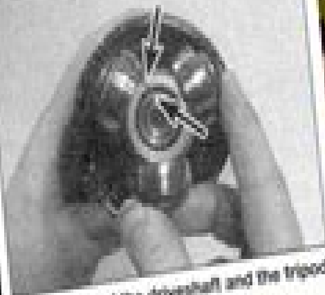
3.5b .... and the driveshaft and the tripod joint