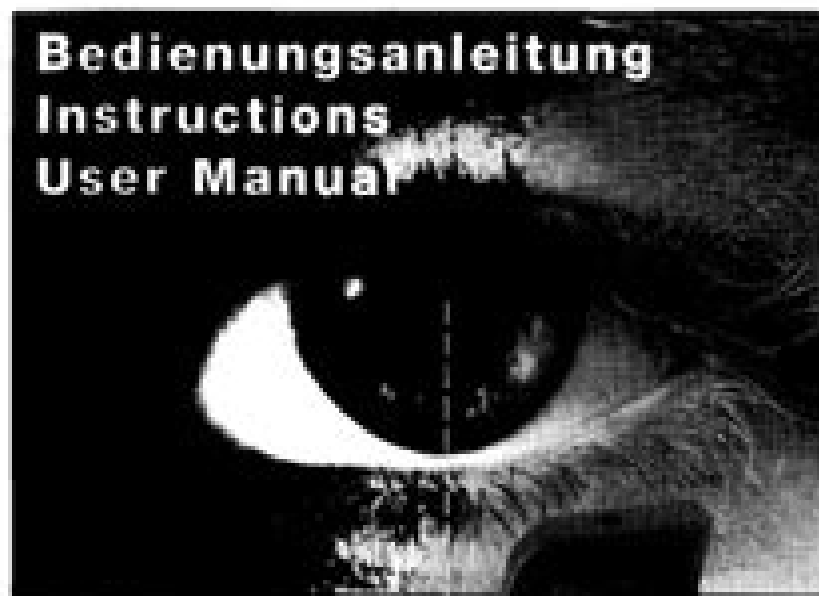
HÄMMERLI SP 20