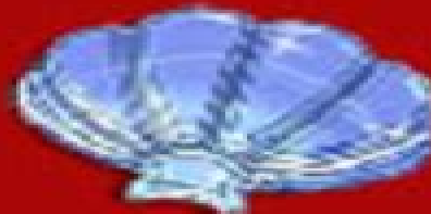
1 Sea Stone