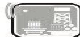
Freight Yard Sound

This engine will operate on any traditional O-31 Gauge track system, including M.T.H.'s RealTrax® or ScaleTrax™ or traditional tubular track. It is also compatible with most standard AC transformers. (See page 19 for a complete list of compatible transformers and wiring instructions.)