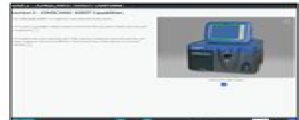
Operator Course Screen