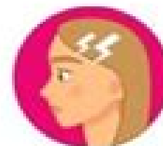
CHANGES OF MOOD