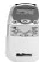
Wireless Remote Control (Standard)