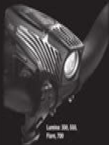
Lumina 100, 150, Flex, 200