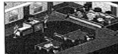
Which roles do you recognize?

The trial court is the first court to hear a case. Both the state and federal systems have trial courts. In the Federal system, the trial court is called a District Court. In the trial court, lawyers use evidence to try to prove that their client's side of the story is what really happened. Evidence can be almost anything—witnesses, videos, photographs, a letter, a piece of fabric, or even a murder weapon! In a jury trial , a group of twelve people listens to the evidence and decides who wins the case. That decision is called the verdict . In a bench trial there is no jury, so the judge gives the verdict.