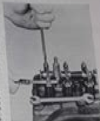
Turning the valve adjuster to set the valve clearance.