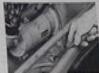
Turning the valve adjuster to set the valve clearance.

on of #1 cylinder. After compression is felt, turn slowly with crank until piston is at top dead center. (Piston is at top dead center when the piston is at the top of the cylinder and the piston is at the top of the cylinder).