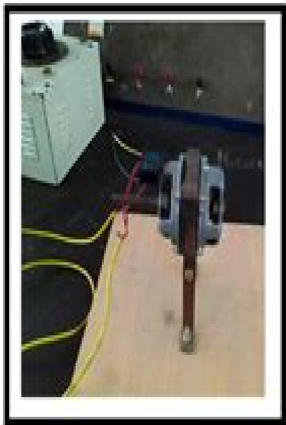
(a) Healthy Motor