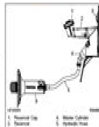
Fig. 5 Clutch Hydraulic Fluid Level Checking

If the fluid level is below the MIN line, fill the reservoir with DOT 3 brake fluid until the level reaches the MAX line. See Fig. 5.