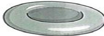
red blood cell

(b) A red blood cell is adapted to carry oxygen in the human body.