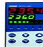
JUMO DICON 400 Type 703575/1...