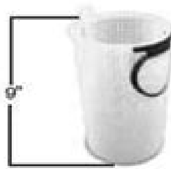
5064-01 MAGNUM FORCE PRIOR TO 2-1-03