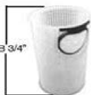
5064-04 MAGNUM & MAGNUM PLUS