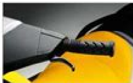
iBR brake lever