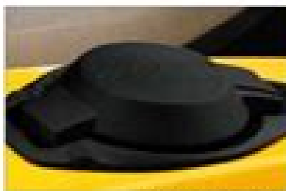
Quick latch fuel filter design