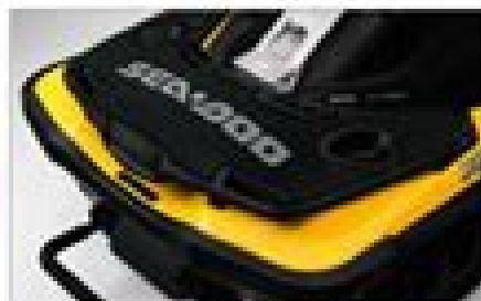
Boarding platform with storage