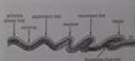
Fig. 19 Types of folding.

is formed (Fig. 19). If it is pushed still further, it becomes a recumbent fold (Fig. 19). In extreme cases, fractures may occur in the crust, so that the upper part of the recumbent fold slides forward over the lower part along a thrust plane , forming an overthrust fold . The over-riding portion of the thrust fold is termed a nappe (Fig. 19). Since the rock strata have been elevated to great heights, sometimes measurable in miles, fold mountains may