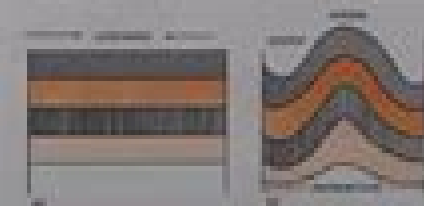
Fig. 18 (a) The horizontal strata of the earth's crust before folding. (b) Compression shortens the crust forming fold mountains.

In the great fold mountains of the world such as