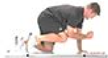
7. Rotary Stability