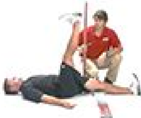
5. Leg Raising