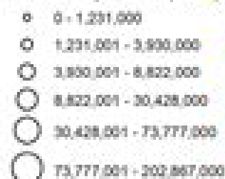
Muslim Population (% of Total)