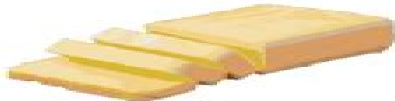
Butter (for baking)