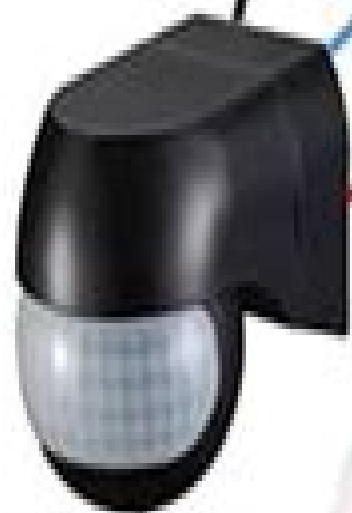
PIR Motion Sensor