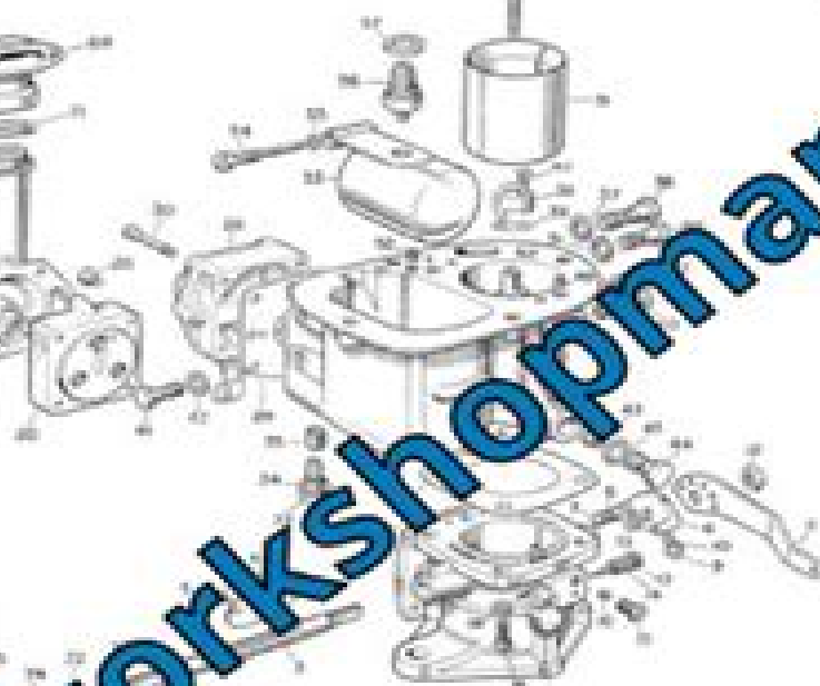
Fig. A-1—Layout of components, by size, prior