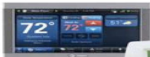
ComfortLink™ II Control

Innovative Trane controls and thermostats enhance the comfort of your Trane EnviroWise™ Geothermal System.