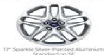
17" Sparkle Silver-Painted Aluminum Standard on SE