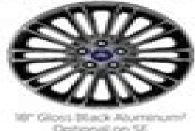
16" Gloss Black Aluminum† Optional on SE