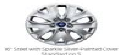
16" Steel with Sparkle Silver-Painted Cover Standard on S