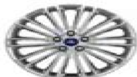
16" Premium Luxor Nickel-Painted Aluminum Optional on SE