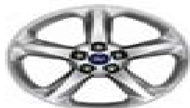
18" 5-Spoke Premium Painted Aluminum Included with Appearance Package