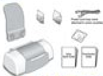
Power cord, ink cartridges, and sample printout