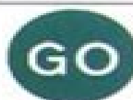
Temporary "Go" sign