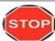
Temporary "Stop" sign