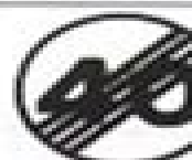
End of speed restriction