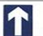
One way traffic