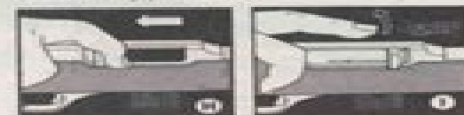
Pull charging handle all the way back.

With the safety on SAFE and the loaded magazine locked in place, the rifle in normal shooting position, and pointed in a safe direction, pull the charging handle all the way back and let it snap forward freely (See H & I).