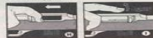
Pull charging handle all the way back.

With the safety on SAFE and the loaded magazine locked in place, the rifle in normal shooting position, and pointed in a safe direction, pull the charging handle all the way back and let it snap forward freely (See H & I).