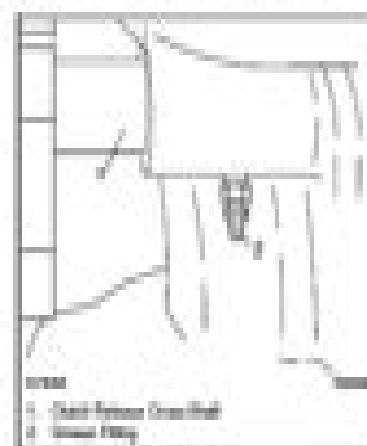
Fig. 3 Clutch Release Cross-Shaft Grease Fitting

The clutch release cross-shaft is equipped with two grease fittings in the transmission clutch housing. See Fig. 3 and Fig. 4. Wipe the dirt from the grease fittings and lubricate with multipurpose chassis grease.