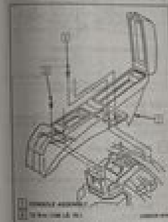
Figure 3 Console Assembly Installation