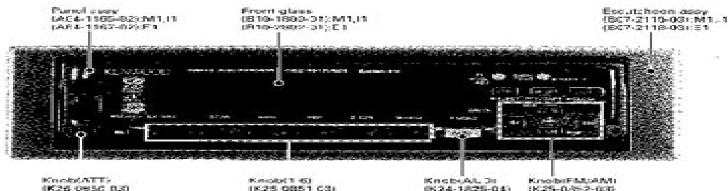
Photo is KDC-PS9060R

© 1998-1 PRINTED IN JAPAN BS1-7266-00 (M) 2087